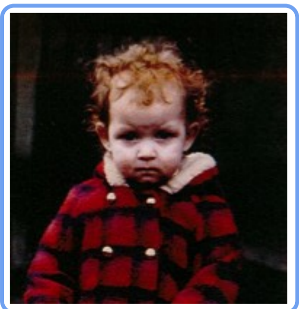
13. I'm now very familiar with this age group.