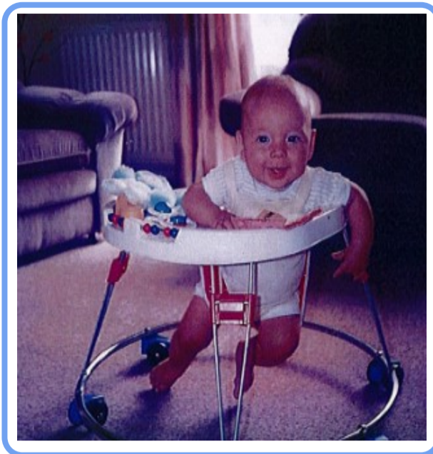
20. I'm new to Year 5 and always calm and composed.