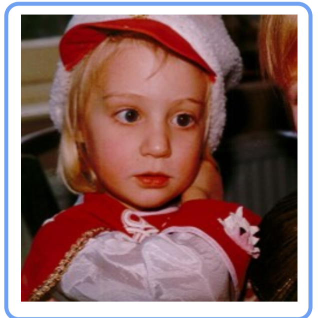
12. I'm new to our school with an Italian sounding name.