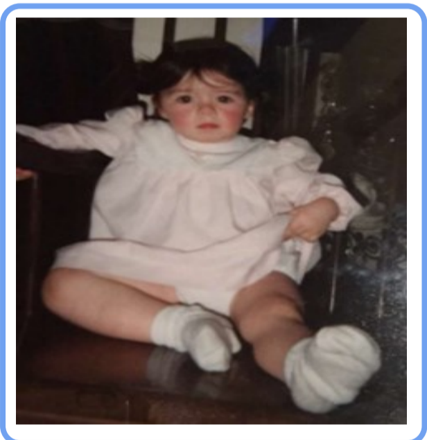
22. From Mayo to Hackney and Year 1 to Year 3.