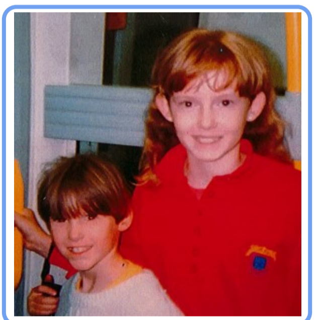
15. I am Millfields' Super Scientist.