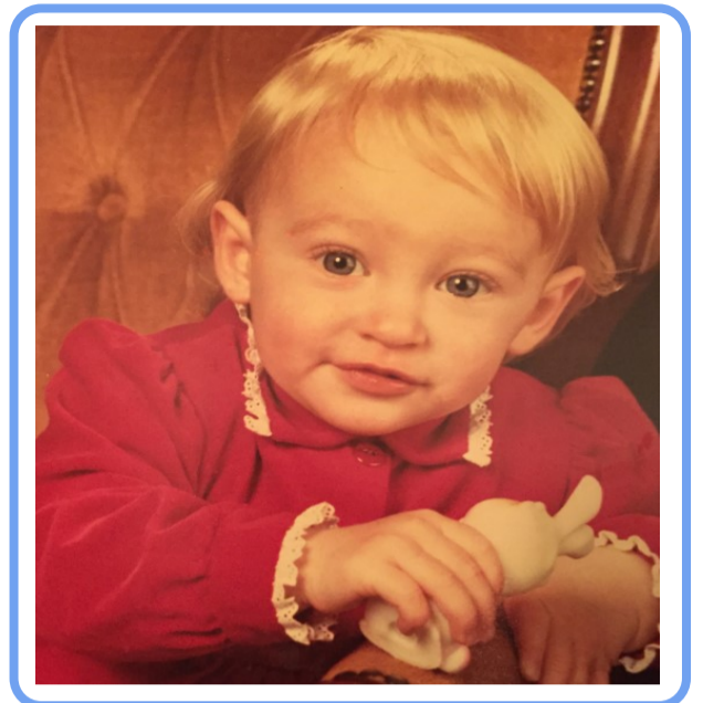
21. I love a sharp suit and a science experiment