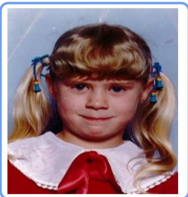
23. See me for sports.