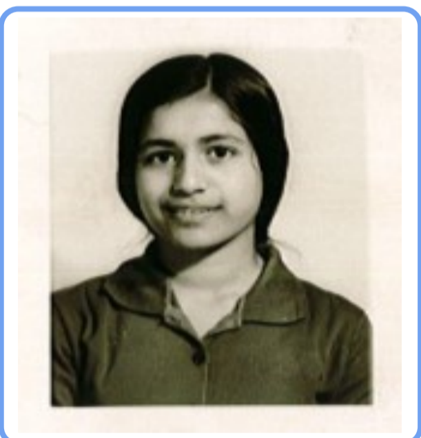
14. I am smiley and helpful and am mum to everyone.