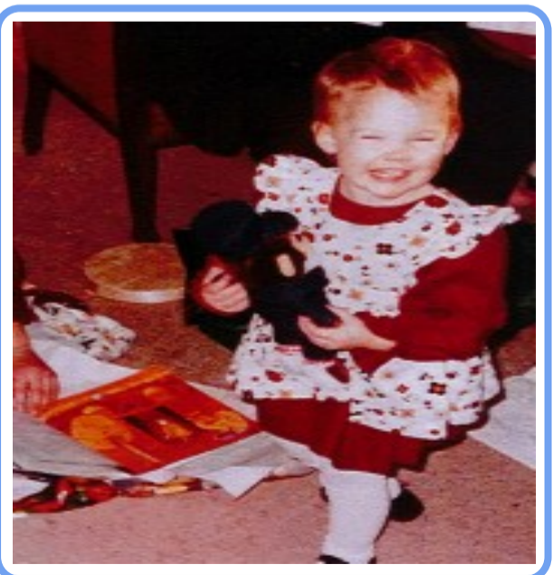
17. I'm back from maternity leave and love a celebration.