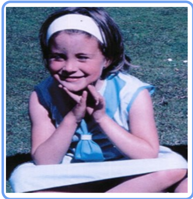
10. I love growing vegetables in my nursery but I love my dog even more.