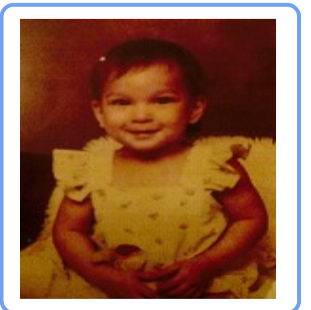
18. I'm new to Key Stage 1 with much longer hair.