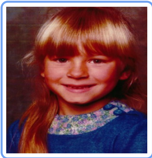
11. You can find me at the front gate or helping with Literacy.