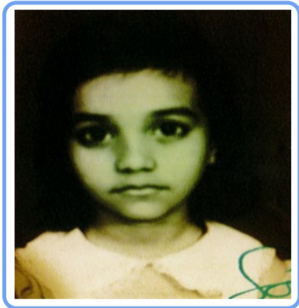
19. I'm one of the longest standing teachers in Key Stage 1.